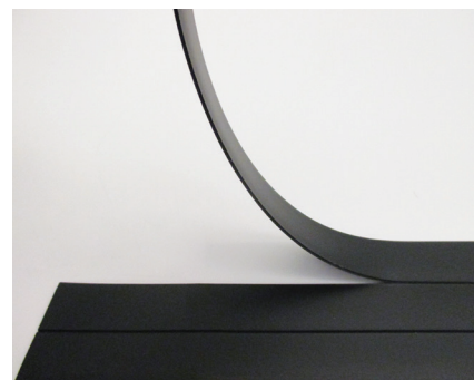
Removal of excess material on the pre-scored line