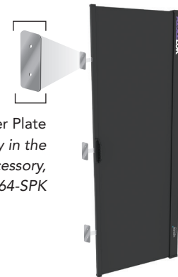
Striker Plate sold separately in the Striker Plate Kit Accessory, part number 10164-SPK